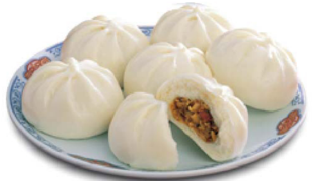
Chinese Steamed Meat Bun

High spec, high quality Encrusting Machine with cutting-edge features.